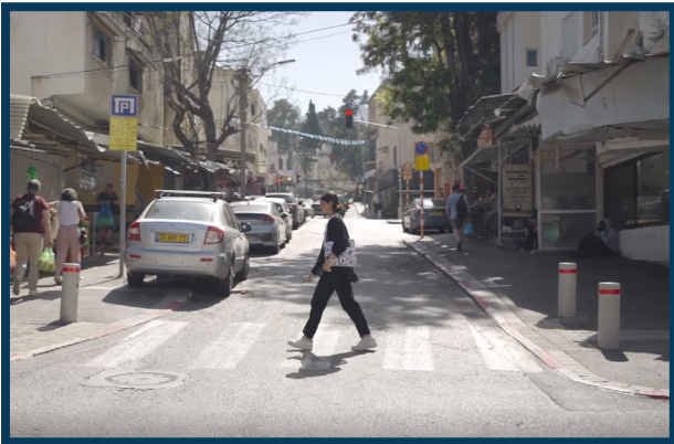
Munia in Haifa