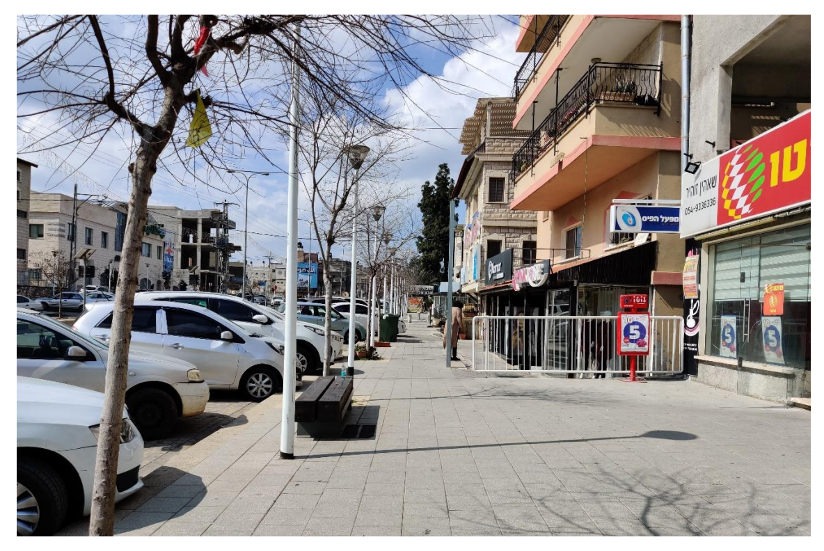
Sakhnin Main Street February 2020.

business owner was successfully convinced to allocate space (approximately 15 feet) to allow wider sidewalks and public parking alongside the main road. As a result, today numerous shops, cafes, restaurants and other businesses are flourishing along the main road; traffic has been significantly reduced as parking is available; and wider sidewalks are encouraging pedestrian activity. According to the municipality, the next planned step is to legislate local regulations that enable collecting parking fees along the road, thus further enhancing local revenues.